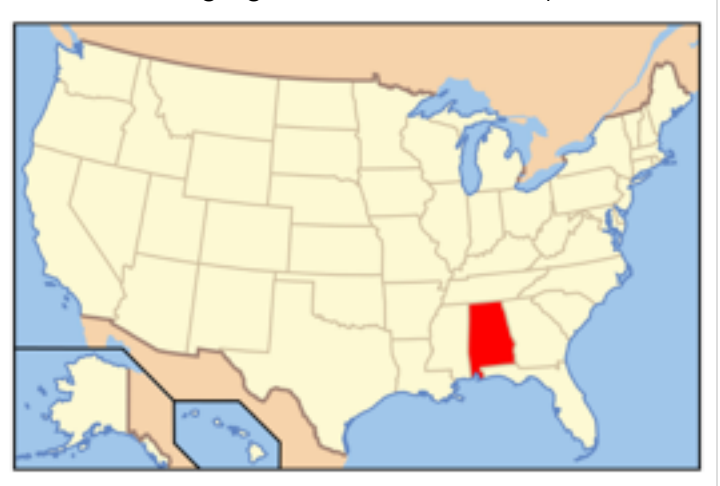
What state is highlighted in red on the map below?