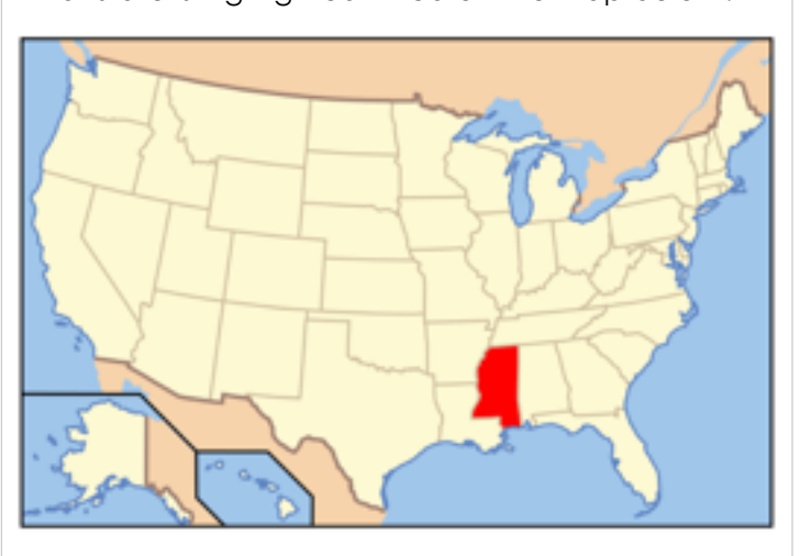
What state is highlighted in red on the map below?